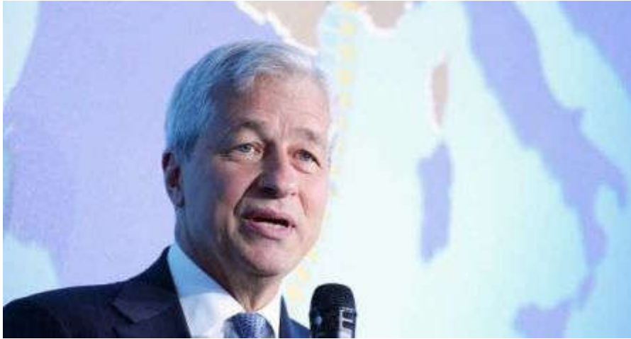
Jamie Dimon, CEO of JP Morgan Chase