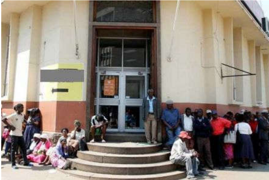
Queuing in front of the office of a well-known money transfer company – in a poor country, and most customers are poor too

money transfer services, which for example tens of millions of migrant workers from poor countries are using to support their families in home country, may charge fees of 2% up to more than 3% depending on destinations, the same transfer can be done for neglectible cost when using only bitcoin, and including transformation from and to a classical currency – both on the side of the sender and of the receiver – fees will total 0.5 to 0.6%. It is difficult to name “ fraud ” a money transfer service that is much cheaper than the competition.